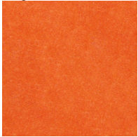
Tangerine - TAN