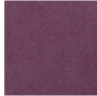
Plum - PLU