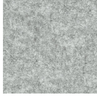
Ash - ASH